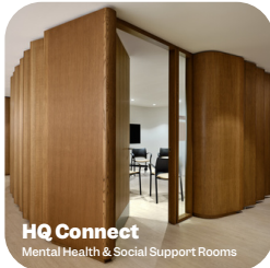
HQ Connect Mental Health & Social Support Rooms