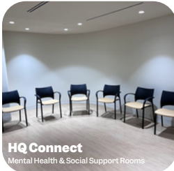
HQ Connect Mental Health & Social Support Rooms