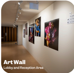
Art Wall Lobby and Reception Area